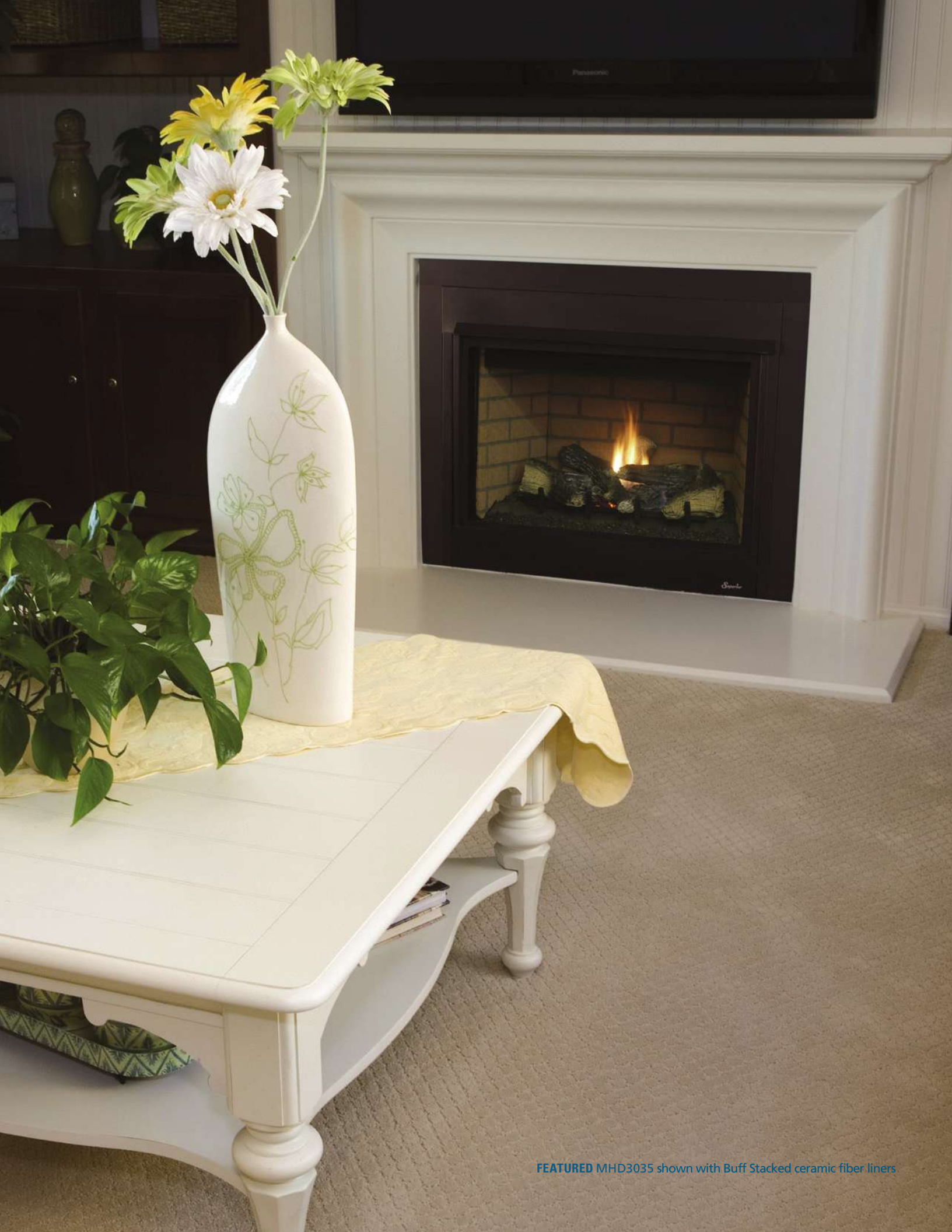
FEATURED MHD3035 shown with Buff Stacked ceramic fiber liners