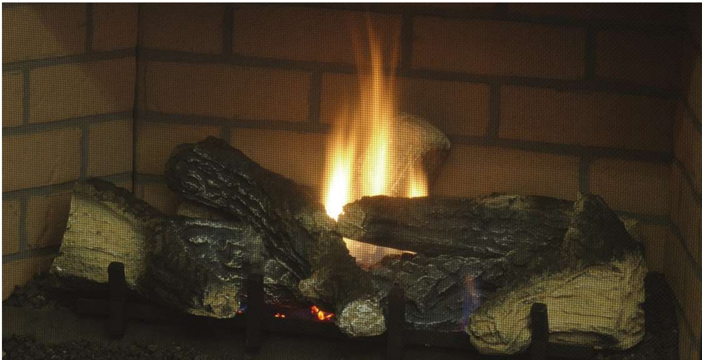
FEATURED MHD3035 shown with "aged oak" log set and Buff Stacked ceramic fiber liners