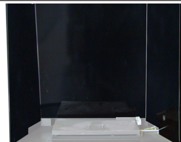
Figure 9: Installing the Left Side Porcelain Panel