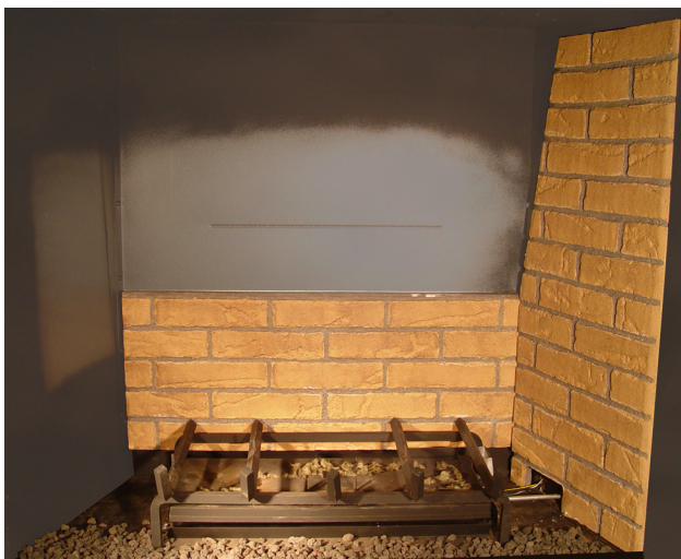
Figure 2: Installing Right Ceramic Panel