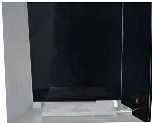
Figure 8: Installing the Rear Porcelain Panel