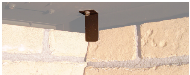
Figure 4: L-bracket