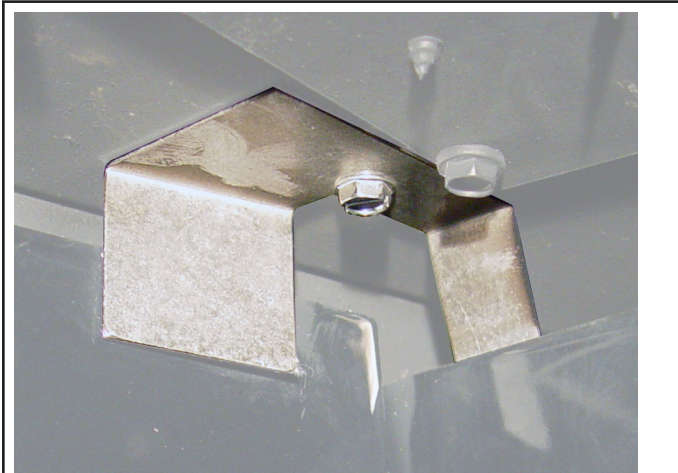
Figure 10: Installing the Left Rear Porcelain Bracket

Step 8. Install the rear porcelain brackets supplied with the kit. Hook the rear left bracket over the top, left corner of the rear porcelain panel and align the bracket hole with the hole from which the L-bracket was removed in Step 1 (refer to Figure 10 ). The bracket should apply pressure to the left porcelain panel and hold it and the rear porcelain panel in place. Follow the same procedure to install the rear right bracket on the right side of the firebox.