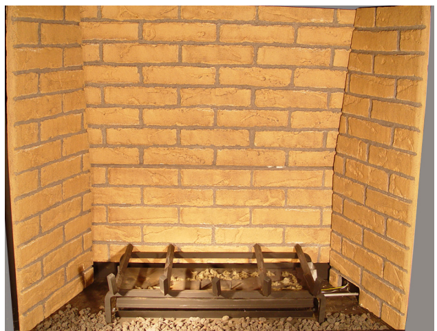
Figure 5: Installing Left Ceramic Panel