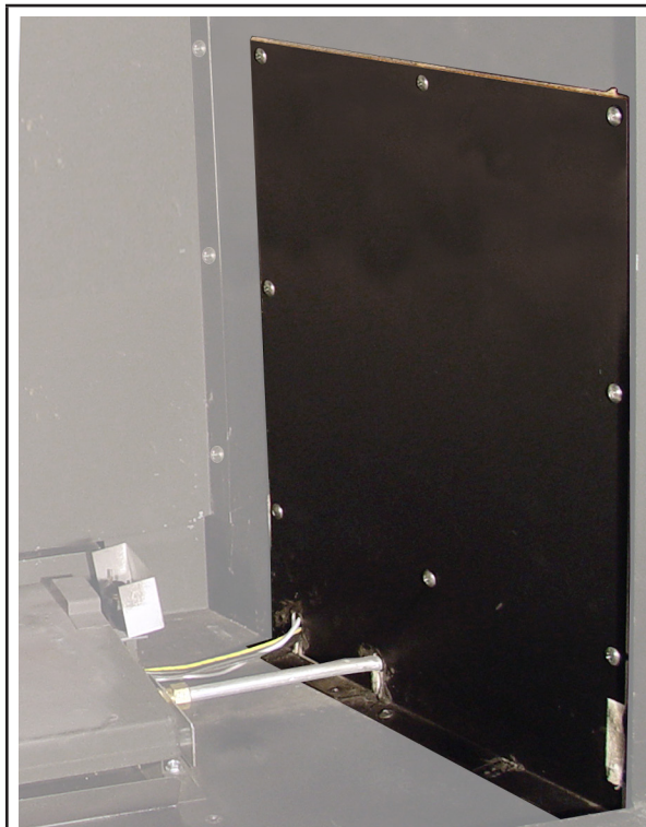
Figure 6: Right Access Panel