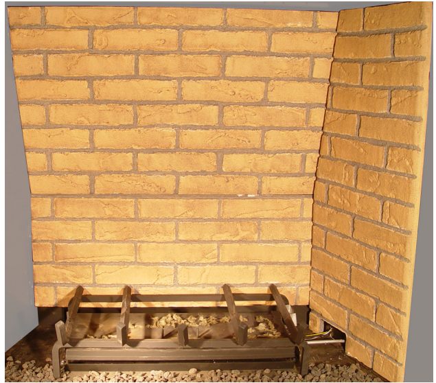
Figure 3: Installing Top, Rear Ceramic Panel