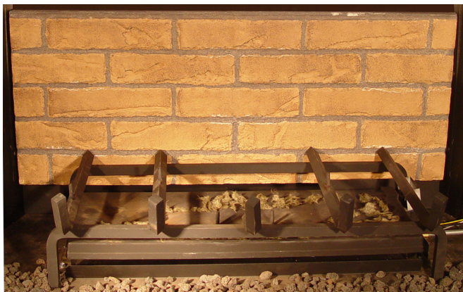
Figure 1: Installing Bottom, Rear Ceramic Panel

Note: Model MDLX45 is shown in Figure 1 .