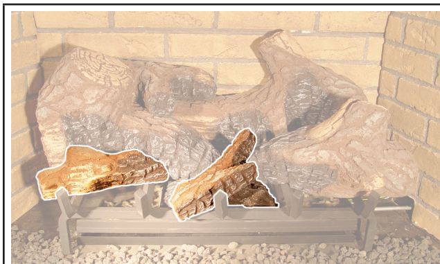
Figure 8: Placing the Left and Center Front Logs

Step 5. Align the grooves in the left front log with the grate and place it on the grate. Slide the log toward the back of the firebox until the left side touches left center log, as shown.