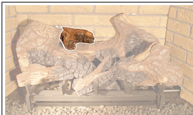
Figure 7: Placing the Top Rear Log

Step 4. Align the hole in the bottom of the top rear log with the pin on the rear log and place it on the pin, as shown.