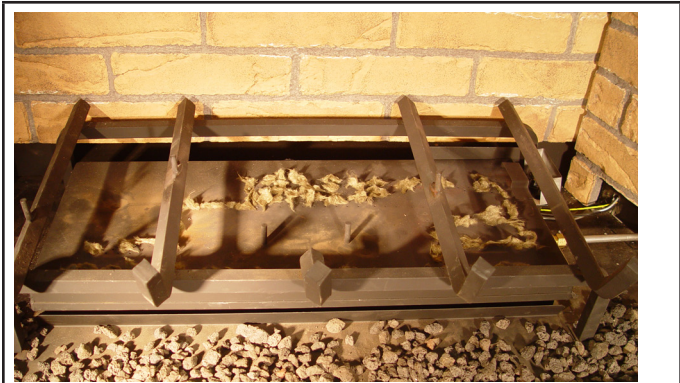
Figure 2: Glowing Ember Placement

Step 2. Place the pieces on the burner, as shown. Do not use more than is necessary. When properly positioned, the glowing embers will cover approximately 75% of the burner for natural gas applications. For Propane gas applications, do not place embers on the main ports (larger holes). Arrange the glowing embers for desired appearance.