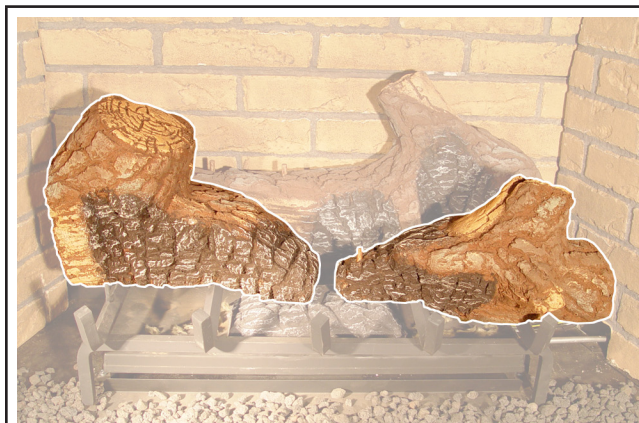
Figure 6: Placing the Left and Right Center Logs

Note: Do not place the logs on the grate pins.