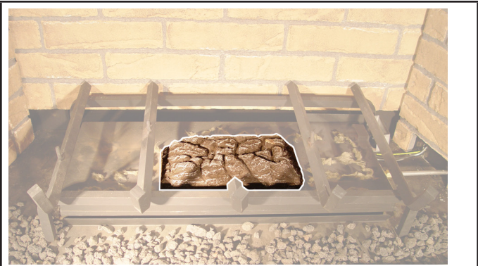
Figure 4: Placing the Center Log

Step 1. Align the two holes in the bottom of the center log with the two burner pins and place the log on the burner, as shown.