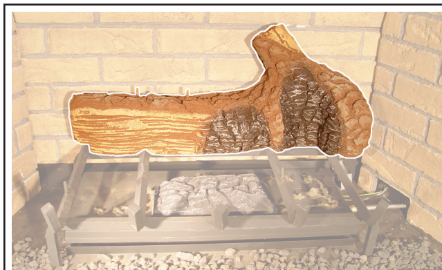
Figure 5: Placing the Rear Log

Step 2. Align the grooves in the rear log with the grate and place it on the grate. Push the log to the rear of the firebox, as shown.