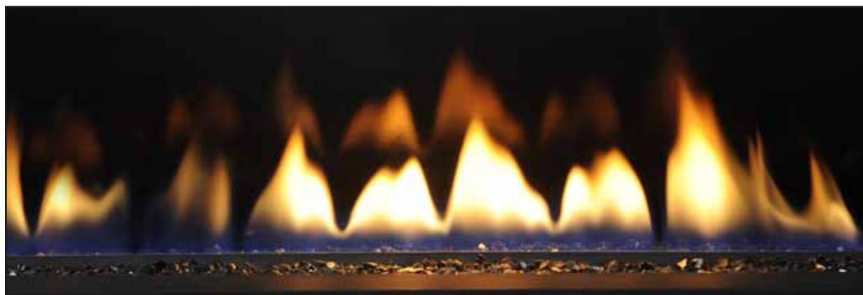
Elite™ LV shown with Reflective Black media and Porcelain interior.

■ The Elite™ LV fireplace represents the latest in technology and design resulting in the ultimate combination of style and performance. The focal point of the LV is its mesmerizing flame. Showcased by a glassy smooth porcelain interior and framed by your choice of optional surrounds, the flame is not only stunning, but, thanks to cutting edge Infini-Flame technology, it is also the heart of a highly efficient heater; the end result being a fireplace that uses less fuel to heat your home while making it more beautiful. ■