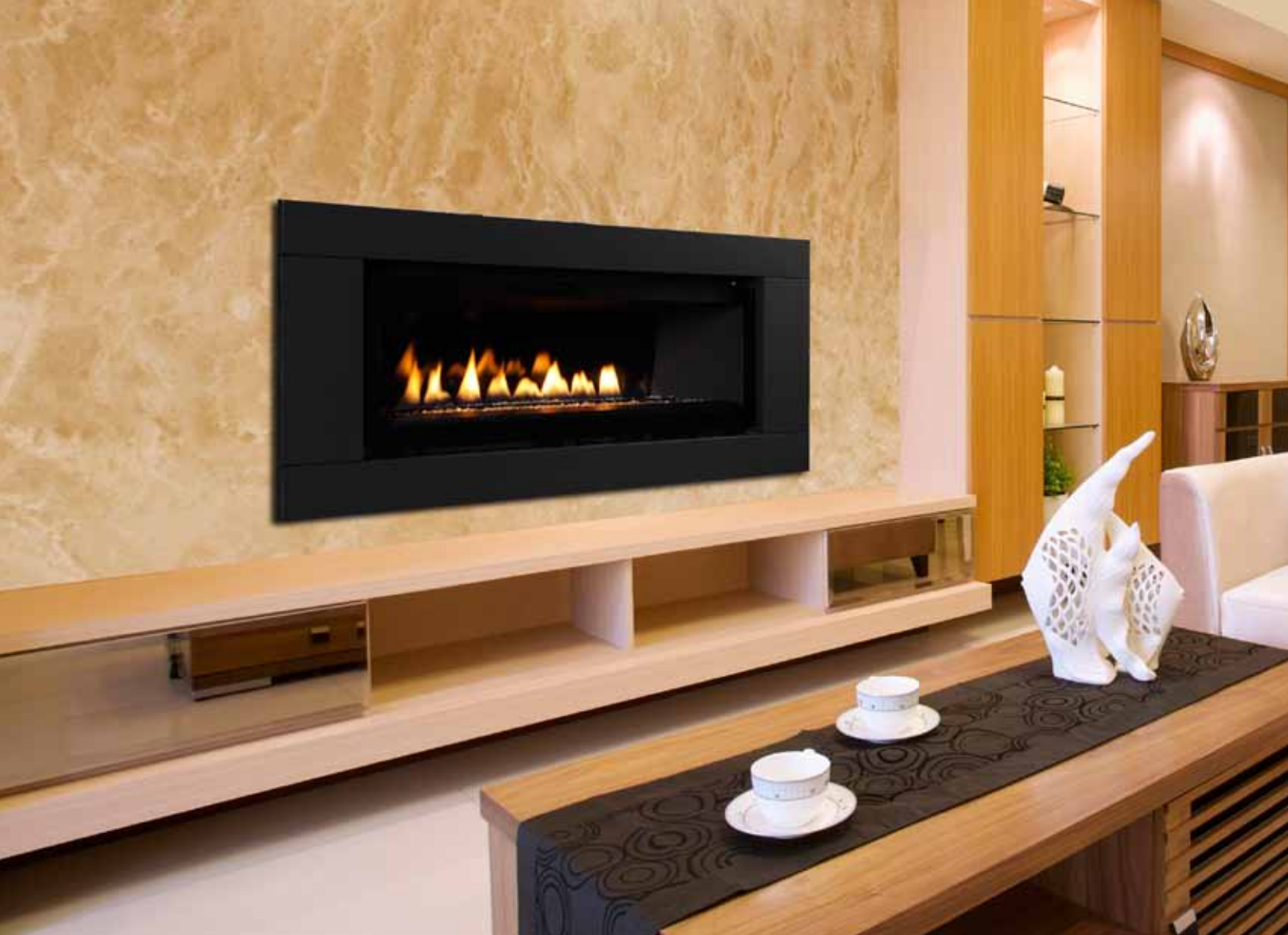
Elite LV™ 54" shown

■ The Elite™ LV fireplace represents the latest in technology and design resulting in the ultimate combination of style and performance. The focal point of the LV is its mesmerizing flame. Showcased by a glassy smooth porcelain interior and framed by your choice of optional surrounds, the flame is not only stunning, but, thanks to cutting edge Infini-Flame technology, it is also the heart of a highly efficient heater; the end result being a fireplace that uses less fuel to heat your home while making it more beautiful. ■