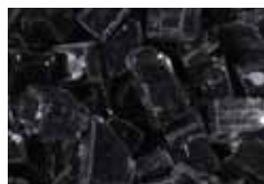
Reflective Black (standard)